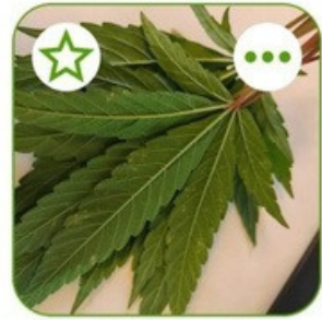
Plant Tissue Can...

Collect cannabis samples ensuring they represent the batch accurately. Handle the samples with gloves to prevent contamination.