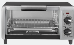
OVEN OR AIR FRYER